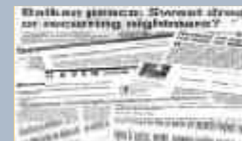
Some of the articles on the Reconciling for the Future' workshop that took place in Thessaloniki in April 2003.